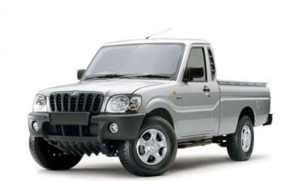
Mahindra Expected 2010

Mahindra is considering introducing a small hybrid-diesel truck .