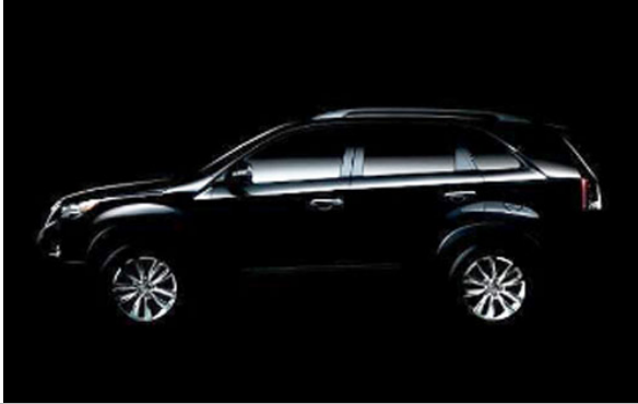
Sorento Expected 2010

A diesel powertrain system is expected on the 2010 Sorento as announced by Kia .