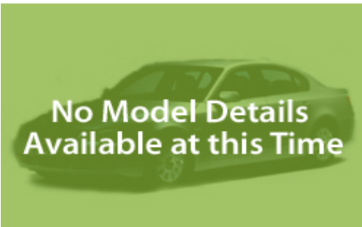
Subaru Impreza/Forester Arriving 2010

Forester and Impreza introduction planned for 2010.